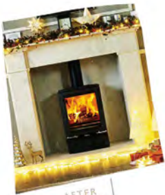
AFTER THE RAIN