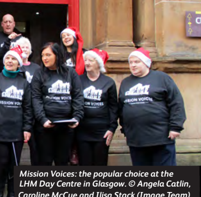
Mission Voices: the popular choice at the LHM Day Centre in Glasgow.