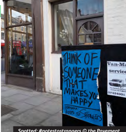
Spotted: #notestostrangers

Low self-esteem can also be caused by difficult life events, such as serious illness, loss and bereavement.