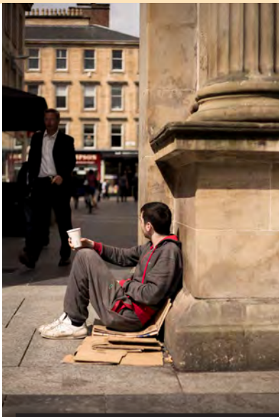
Homelessness and suicide are caused by similar life-changing events

services and support, those in more socio-economically disadvantaged circumstances were left more vulnerable.