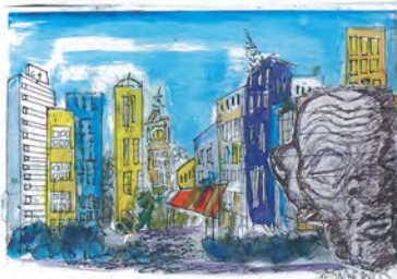
Below: Study of rough sleepers near Hackney Wick station